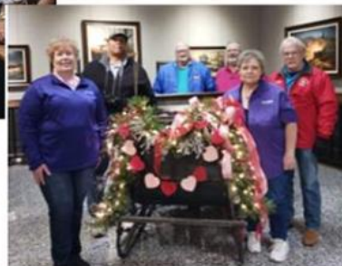
Senators having a wonderful time at the Terry Redlin Art Center in Watertown, SD before the SD JCI Senate Winter Meeting.